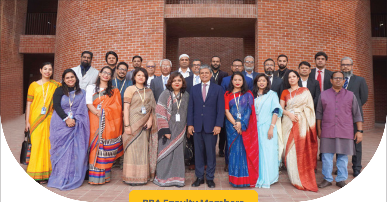
BBA Faculty Members

95% OF FACULTY MEMBERS HAVE DEGREES FROM TOP-CLASS FOREIGN UNIVERSITIES