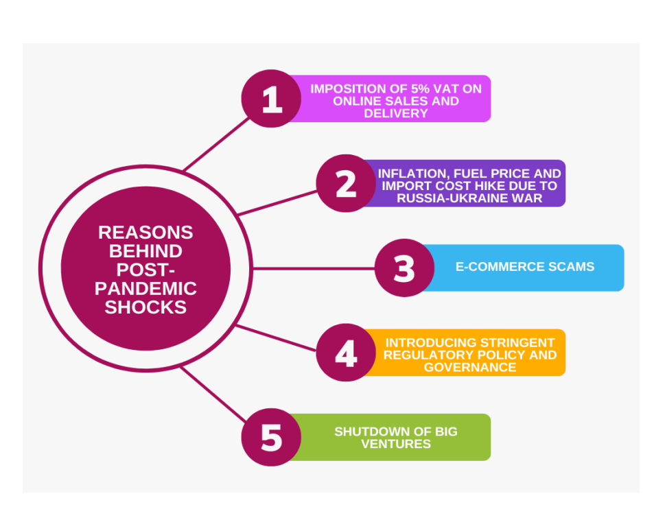
Figure 2: Reasons for postpandemic shocks

commerce business. Under this scheme, e-commerce entities have to get registered to acquire a DBID number.<sup>7</sup>