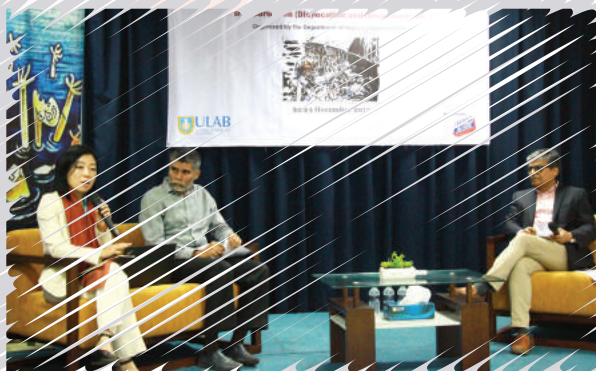
Panel Discussion on "Working with the Rohingya: Donors' Perspectives"